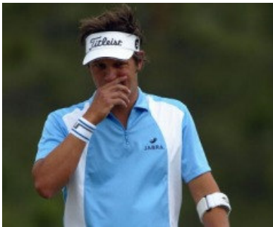
Fredrik Jacobson.

Fredrick Jacobsen also birdied the 17th and couldn't believe it when his birdie putt lipped out on the 18th leaving him with a one over par 73 and and 9 under total of 279 for the week. That gave him a share of fourth place with Kevin Na, Woody Austin and Robert Allenby. The points Jacobson gained moved him up from nineteenth to sixteenth place in the World Golf Rankings.