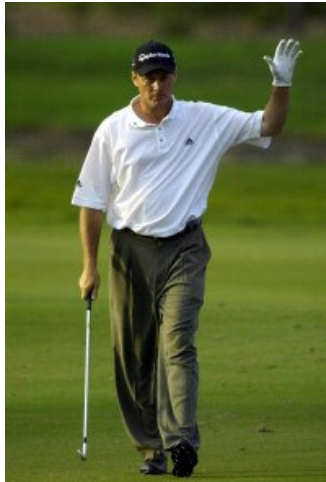
2004 Honda Classic

Although he has been winning tournaments since 1992, and won 4 tournaments last year alone, earning himself over a million dollars in the process, Todd Hamilton is not well-known in the western hemisphere. This is mainly due to the fact that his victories were in Japan and his earnings were in Yen, finishing 2003 in third place on the Japan Tour money list.