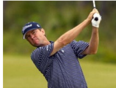
Davis Love III.