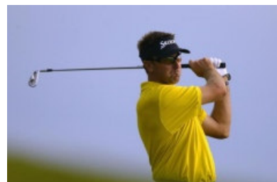
Robert Allenby.

Hamilton's $900,000 prize money moved him swiftly up the 2004 money list from #95 to #9. Todd Hamilton is featured in this week's Player Profile .